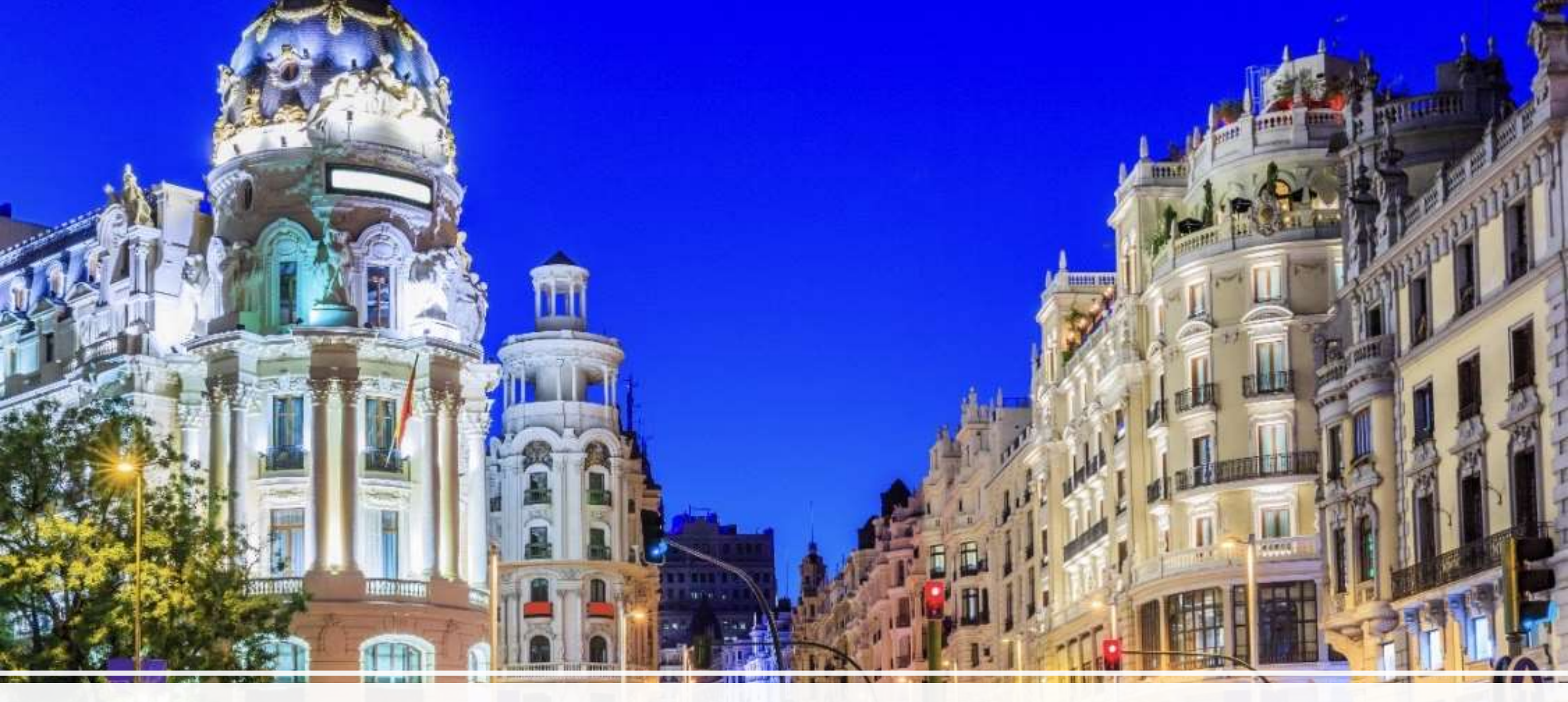
Unveiling the Charms of Spain with RealtyPlus